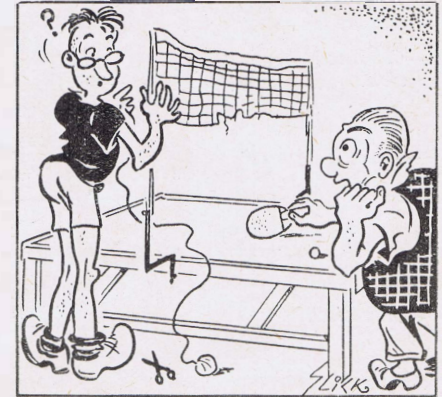
"Off-hand Johnson, I'd say it was just a teeny bit too high!"