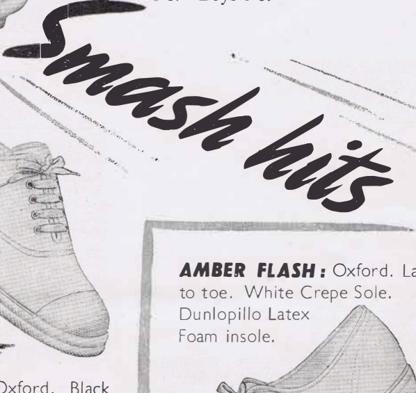
WHITE FLASH: Oxford. Black 'Hard Court' Soling. Dunlopillo Latex Foam insole.